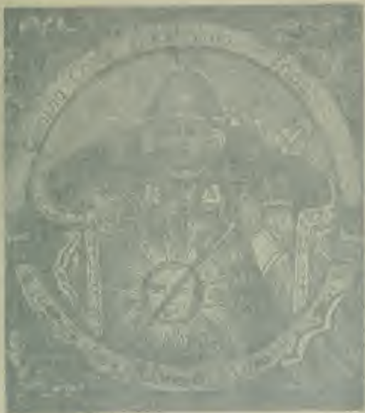
THE INCA HUAYNA CAPAC